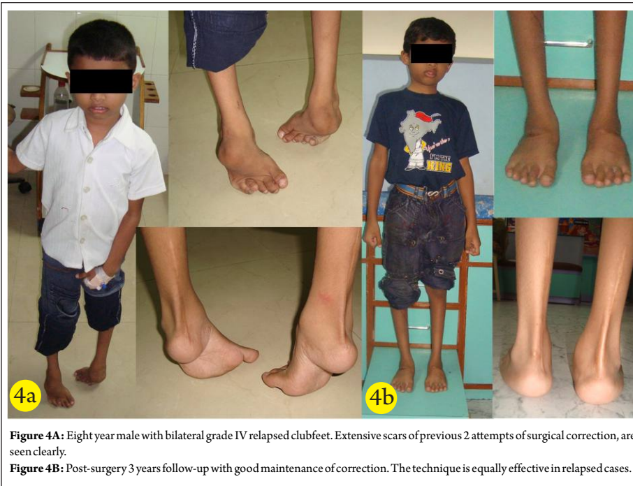
Figure 4A: Eight year male with bilateral grade IV relapsed clubfoot. Extensive scars of previous 2 attempts of surgical correction, are seen clearly.