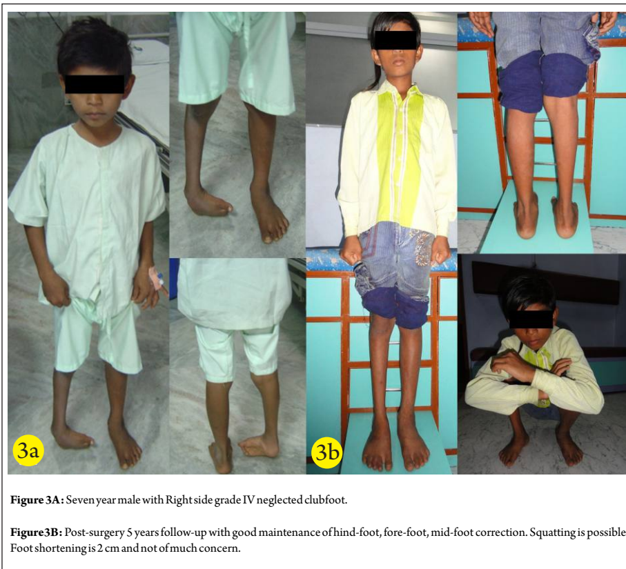
Figure 3A: Seven year male with Rightside grade IV neglected clubfoot.