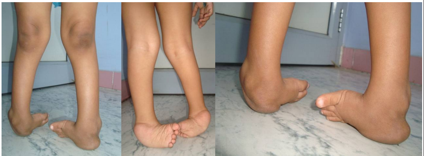
Figure 1: Six year girl with bilateral neglected clubfeet. These feet are prone for injuries at callosities formed at dorsum of feet.

lateral aspect at the apex of the deformed foot (Figure 2C). The incision extends from the lateral border of the foot to just short of the medial border. The elliptical skin and preformed bursa are excised. All dorsal musculature is separated and preserved with a periosteal elevator and chisel and then retracted. The dorsal neurovascular bundles are protected. The osteotomy is marked with an osteotome at the apex of the deformed foot. The wedge should be wider dorsally (1-2 cm) and taper towards the sole (Figure 2D). The amount of bony wedge required depends on the severity of the deformity. A rough clinical guide that can be used is that children who walk on the lateral border of the foot usually do not require more than 1-1.5cm of